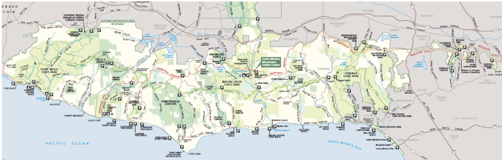
Santa Monica Mountains National Recreation Area – a wide variety of partners