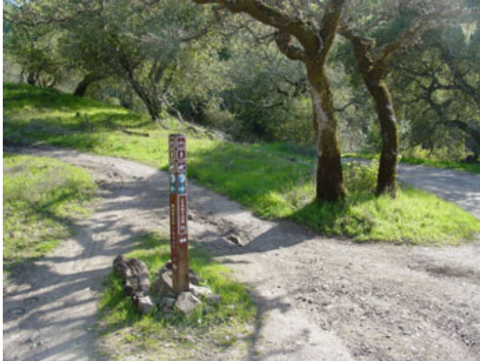
Annadel State Park